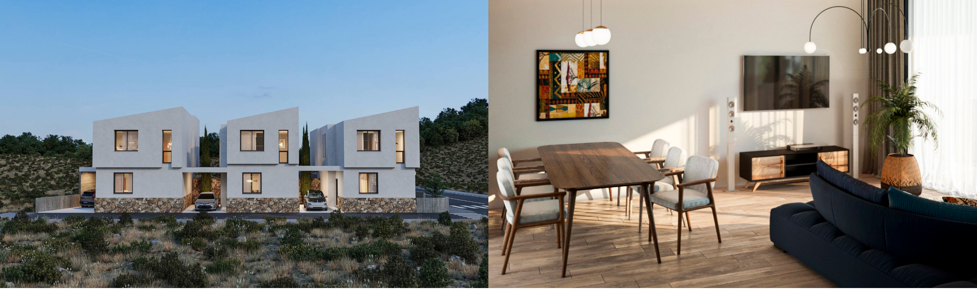
Your dream home in Paphos!

BEEHIVE is located on top of a hill, offering spectacular panoramic views of the Mediterranean Sea and Paphos town. The amazing architecture, view and location ensure a comfortable modern environment that is highly suited for either permanent residence or holidays.